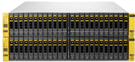
HPE 3PAR StoreServ 8000 Storage (4-Node Storage Base)