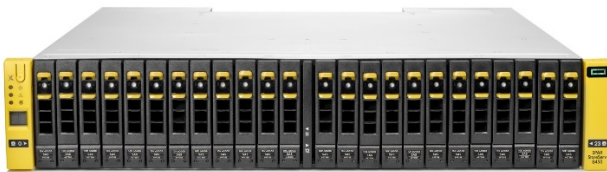
HPE 3PAR StoreServ 8000 Storage (2-Node Storage Base)

HPE 3PAR StoreServ 8000 is storage made effortless.